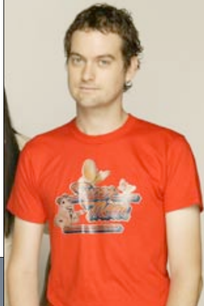
PHOTOGRAPHY / MIDSUMMA, RORY DANIEL / STRIKE BOWLING BARS

VISITOR INFORMATION Tel. (03) 9658 9658 Web: www.visitmelbourne.com